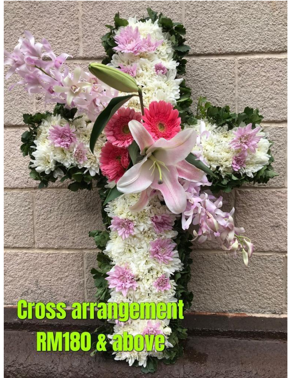
Cross arrangement RM180 & above