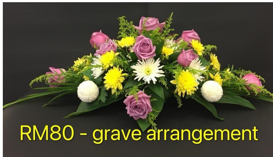
RM80 - grave arrangement