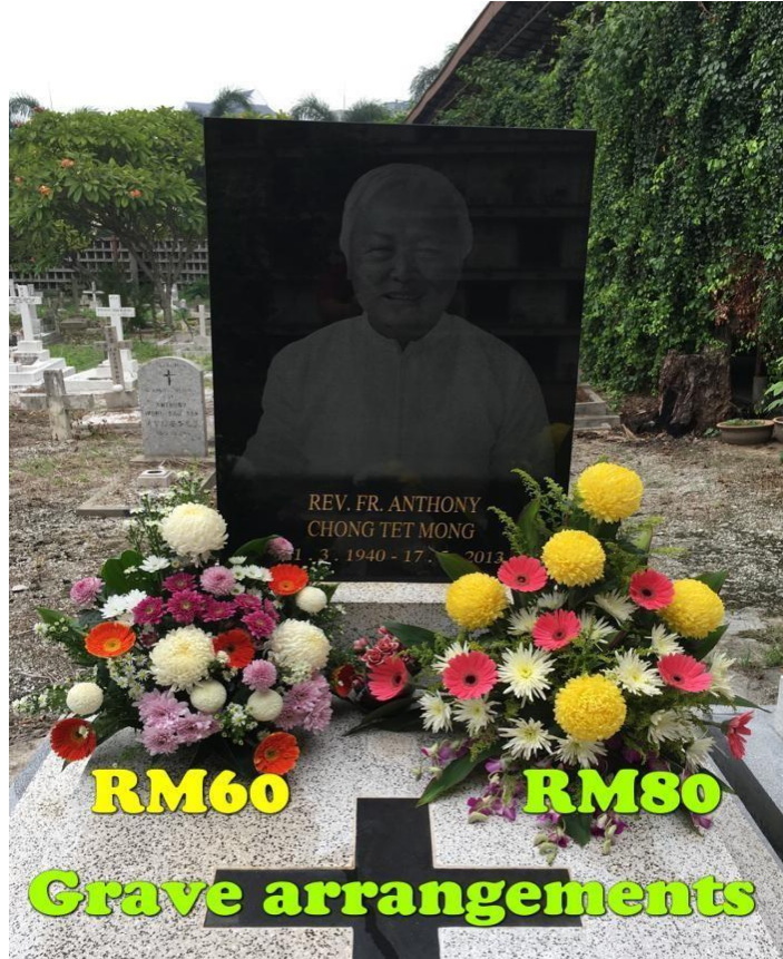
RM60 RM80 Grave arrangements